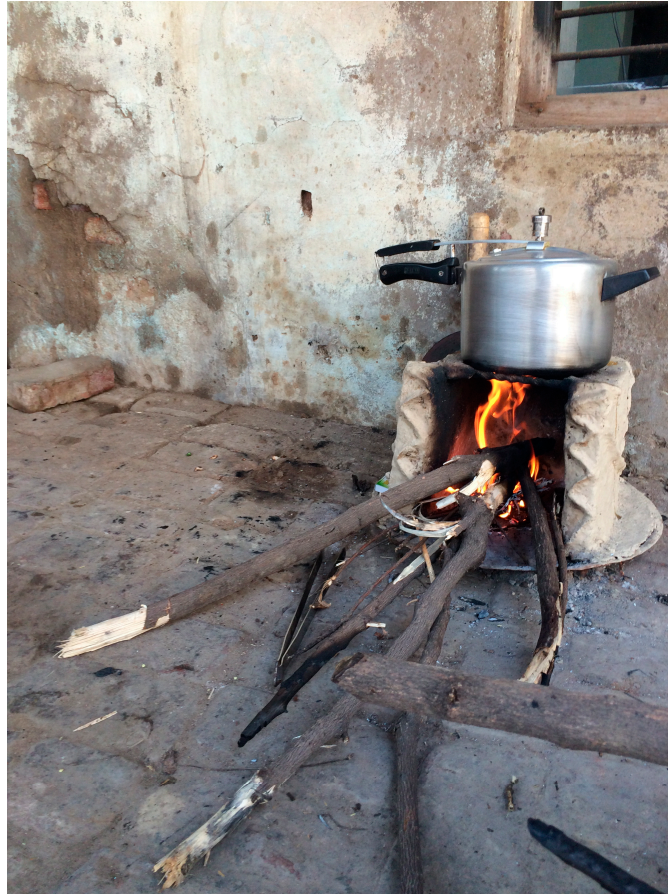
Figure S2. Chulha stove using brushwood.