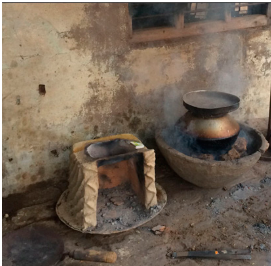
Figure S1. Chulha (left) and angithi (right) used during this project. The angithi is loaded with smoldering cow dung patties and used to simmer animal feed.